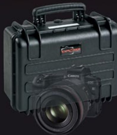
CANON EOS R