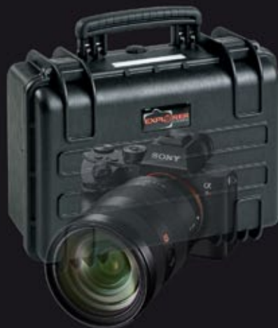
SONY A7R III